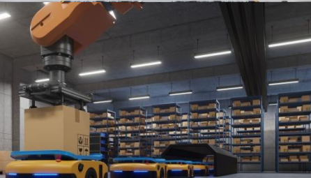
Lift & Material Handling