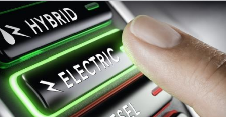
Hybrid Electric Vehicle